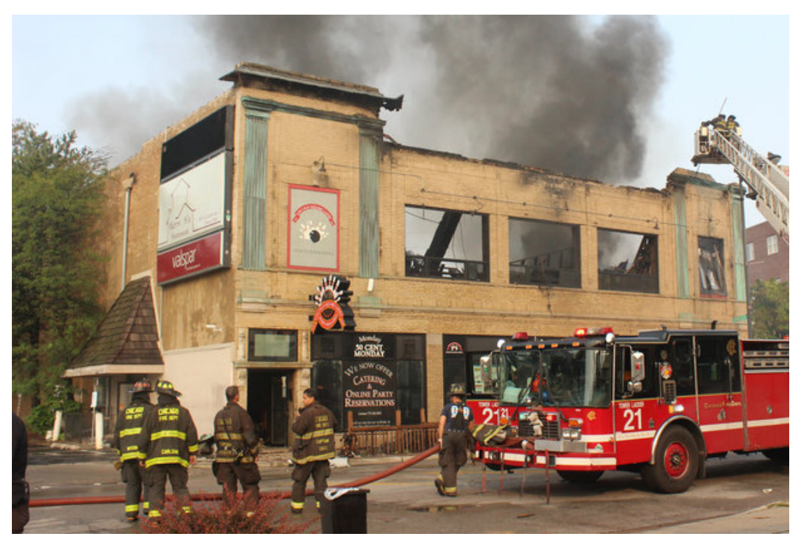
The building that housed Lincoln Square Lanes and Matty K's Hardware burned in 2015.

After the fire, Matty K's Hardware pledged to rebuild. But since 2015 no activity or updates have been posted to their Facebook or Go Fund Me pages. As of Thursday the Go Fund Me page, which launched in September of 2015, had raised $14,853 of its $50,000 goal. The store's owners couldn't be reached for comment.